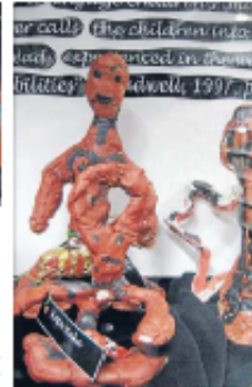
Waitakere Central Library – Kiri Area: 3 Ratanui Street, Henderson.

"Te Ao Maori: Reflection Through the Eyes of our Children" is still available for viewing at the