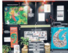
Bright Sparks children's first exhibition: Te Ao Maori: Reflection Through the Eyes of our Children.

From the simple viewing of photographs, to the children's spontaneous incorporation of Maori costumes in their dramatic play, from planting their own garden, to de-constructing the patterns of the koru and modeling clay artifacts, an individualised focus shifted towards building a holistic base of knowledge.